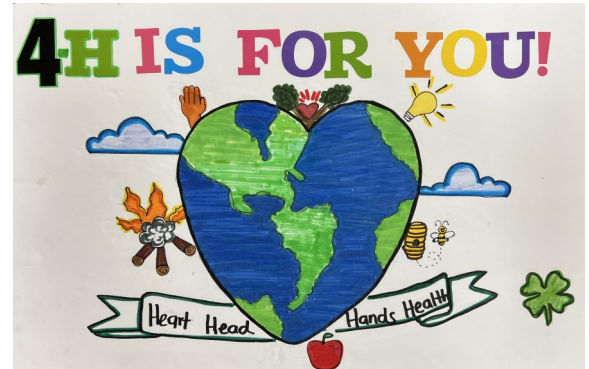
2023-2024 4th grade—1st place winner

This contest relates to 4th grade state standard R14.7 5th grade state standard is RI.5.7. This contest may be a class requirement. State standards are available on our website.