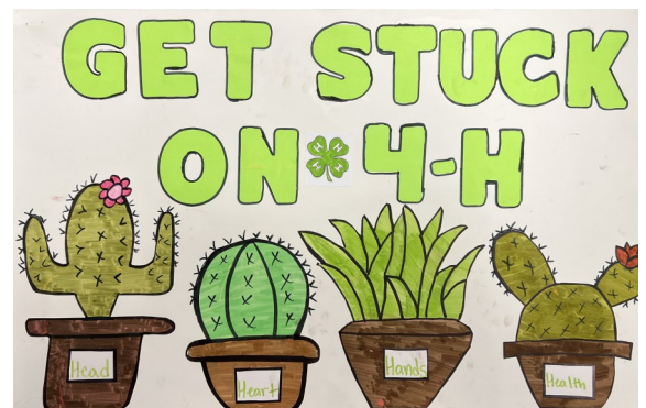
2023-2024 5th grade—1st place winner

The Top 10 posters in each grade division will be kept at the Extension office and exhibited at the 2025 Wilson County Fair.